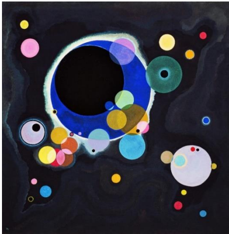
Several Circles, 1926 by Wassily Kandinsky

Students learned about artist Wassily Kandinsky and how he loved making ABSTRACT paintings and was influenced by music. We heard a story about his life in a book called “ The Noisy Paintbox .” We studied the painting “Several Circles” painted in 1926 and noticed all the overlapping circles and his black background. Kindergarten and First grade students created their own version of this painting by overlapping of circles. Students printed various sizes of overlapping circles on their paper. Once dry, each student painted the circles and free form shapes created by overlapping circles then painted their background, some chose black like Kandinsky. We hope you enjoy the beautiful compositions.