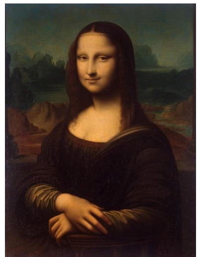
MONA LISA by Leonardo da Vinci